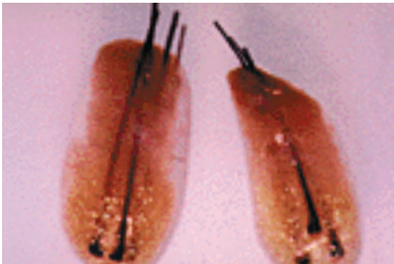
Fig. (1): Dissected individual hair until: Note the grouping of two to three hairs in close anatomical relation.