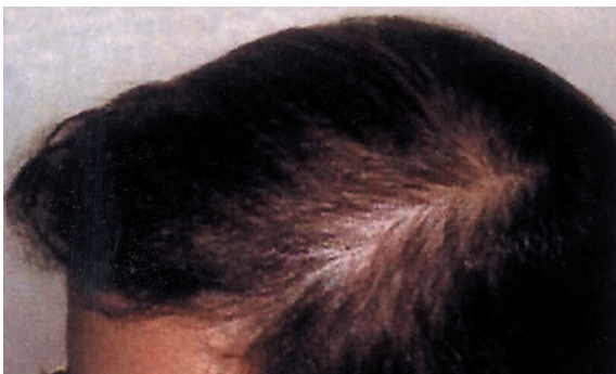
Fig. (3-B): One-year after follicular hair unit transplantation.