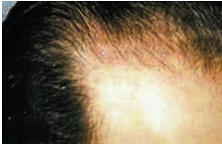
Fig. (4-B): One-year after follicular hair unit transplantation.