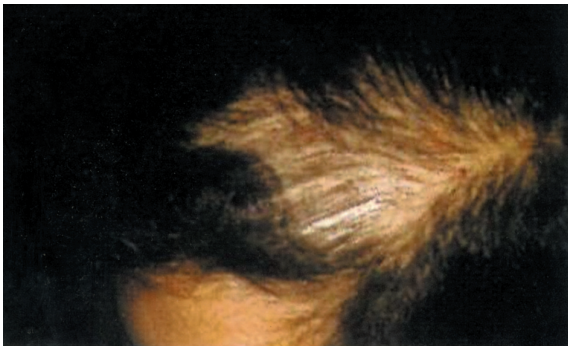
Fig. (3-A): 27-year old male patient with Baldness of vertex area.