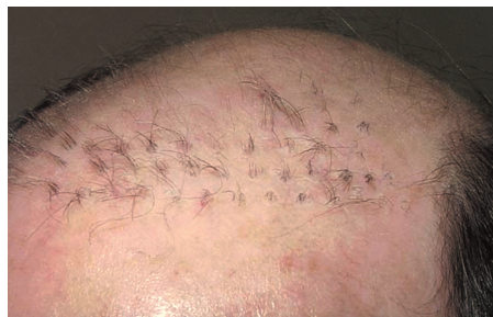
Fig. (6): 36-year old male with baldness. Hair transplantation by mini and micrografting one-year postoperative. The hair is weak, sparse, low density with unnatural look.