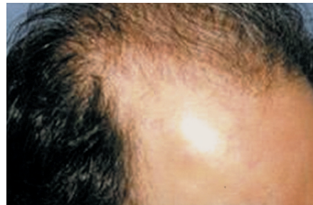
Fig. (4-A): 37-year old male with baldness of frontal area.